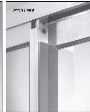
FIG. 4 - VINYL DRAFT SEAL