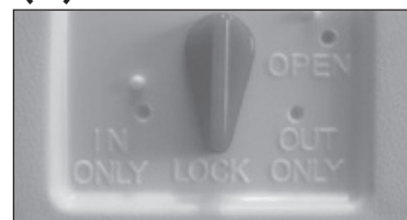
Red Adjustment Dial

Adjustable flap operation - Using the Red Adjustment Dial (D) located on door's lower inside frame (A), adjust to match desired operation as indicated on door. In only, out only, open and lock. (See picture detail at right)